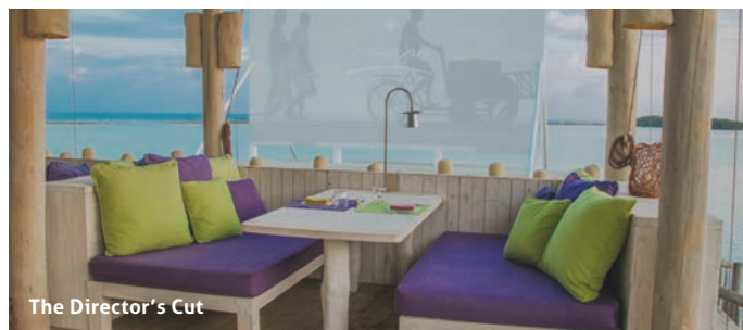
The Director's Cut

Dinner: 19:30 to 22:30 every night except Mondays and Fridays