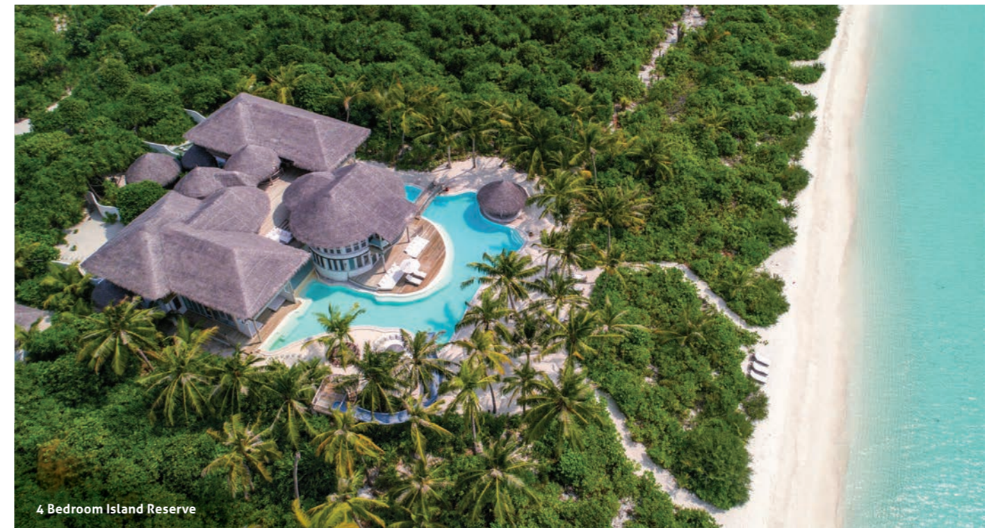
4 Bedroom Island Reserve

Our overwater, open-air cinema is located in a tranquil bay to the south of the island. Our new eight-table over water Peruvian restaurant serving a set menu and a la carte